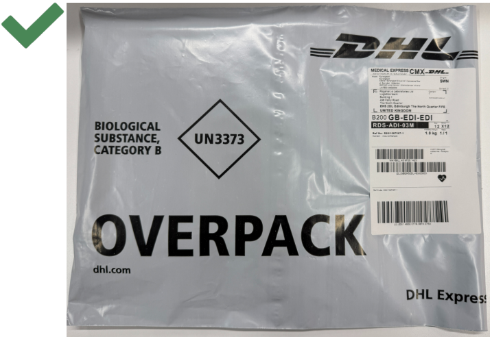
Keep bag full size and place label in a clear space