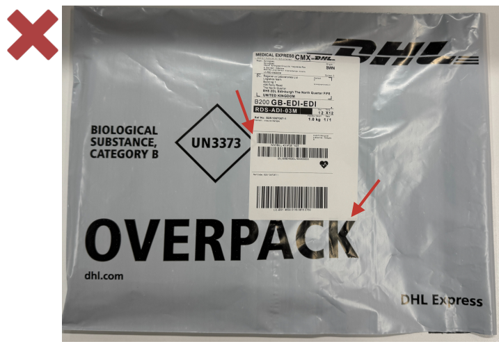
Do not allow label to touch UN3373 diamond or OVERPACK wording