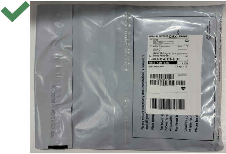
Use front or back of bag to place label