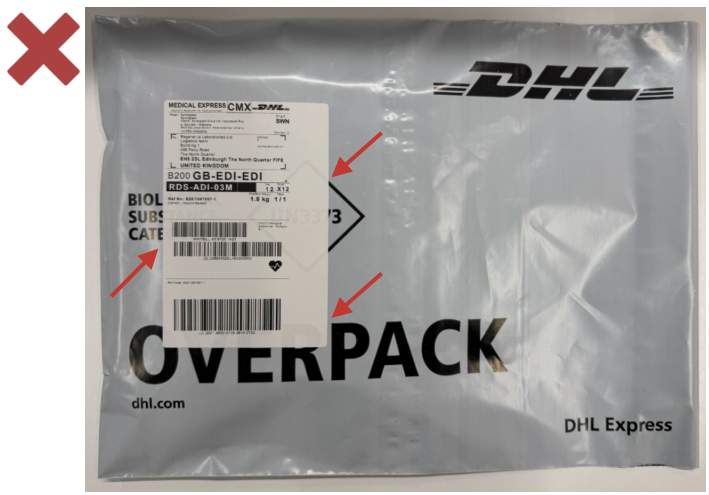
Do not wrap bag around sample or obstruct wording