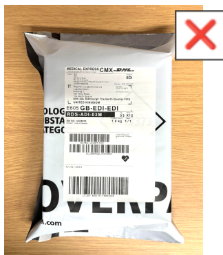
Do not wrap bag around sample or obstruct wording