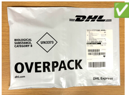
Keep bag full size and place label in a clear space