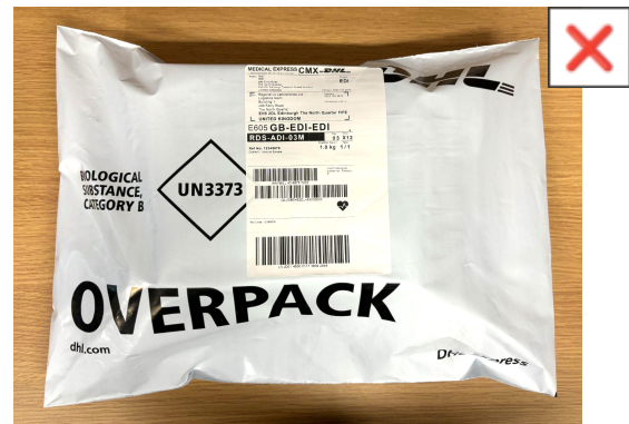
Do not allow label to touch UN3373 diamond