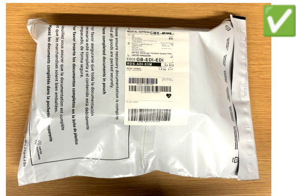
Use front or back of bag to place label